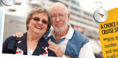
More Cruises and Flights

A CHOICE OF INTERNATIONAL CRUISE STOP OVER