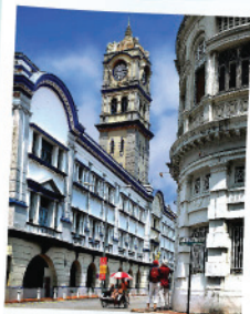
Blossom of Penang Tourist spot