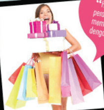
Duty Free shopping Heaven

HATI BERDEBAR-DEBAR "Hatiku berdebar-debar, perasaan gembira untuk membeli-belah di pasar raya dengan harga murah."