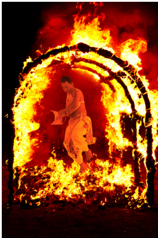
57 NINE EMPEROR CELEBRATION IN ALOR SETAR Category: Professional Devoted Kedah

Every ninth lunar month of the year, thousands of Chinese devotees celebrate the annual nine-day vegetarian festival. The festival observed by Taoists is dedicated to the nine sons of Dou Mu, the Goddess of the North Star, who is believed to control the books of Life and Death. During this period, the mediums perform performances in each temple to celebrate the festival.