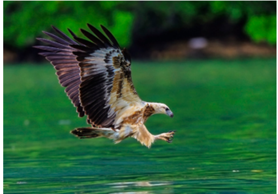
26 SOARING EAGLE By Chua Chee Eam Category: Professional Birds

Pulau Langkawi, known as Langkawi the Jewel of Kedah, is famous with eagles. One of the most attractive activities is the “eagle feeding”.