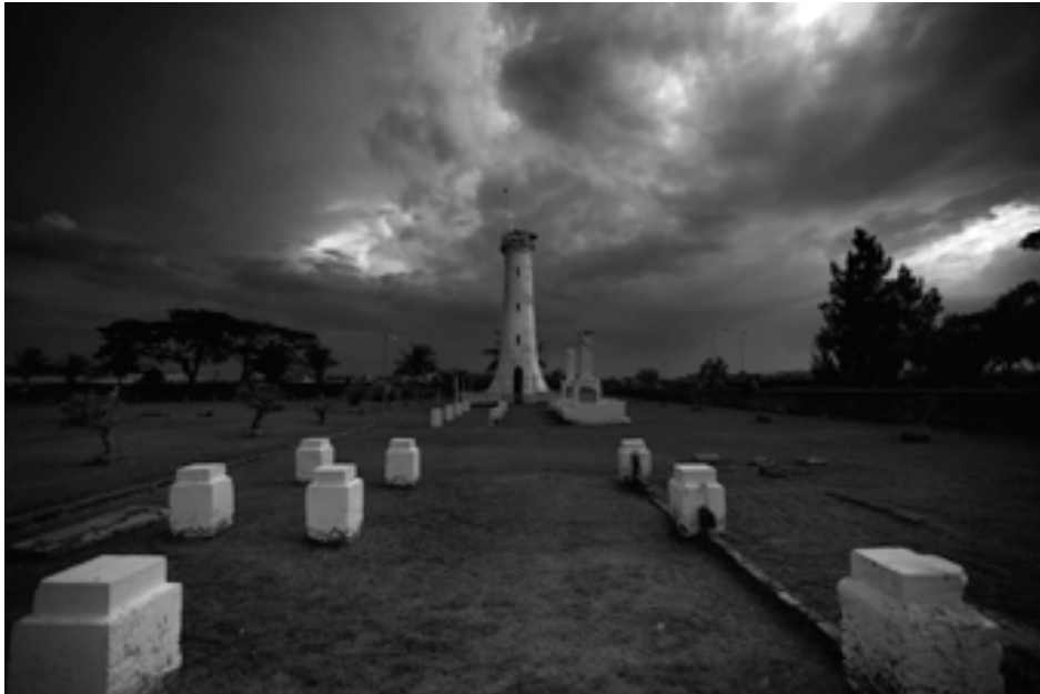
4 KUALA KEDAH LIGHTHOUSE IN MONO Category: Amateur History of Kedah